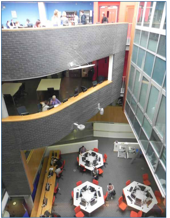
Photo 2: Group and individual study spaces, Queen Margaret University.

Discomfort is a great distraction to learning. Heat and cold, noise and levels of natural and artificial lighting should all be carefully regulated. Seating should take into account different body sizes, accessibility requirements and the long periods of time students sit without moving. Adequate surfaces for writing and supporting computers, books, and other materials are also required: the small, sloping surfaces on most standard tablet arm chairs are inadequate for these purposes. Current trends in integrating learning and social space bring their own set of issues, not least the transmission of noise and odours from hot food from social spaces into more formal study areas, so zoning and differentiation needs to be carefully thought through. Beyond these functional requirements we also need to think about how to create an appropriate ambience for each space so that students want to spend time there. University planners look to create a sticky campus by creating the right environment to retain students through the day. This might mean looking at factors such as extending coffee shop hours on campus and providing adequate space to store personal possessions like bags and coats.