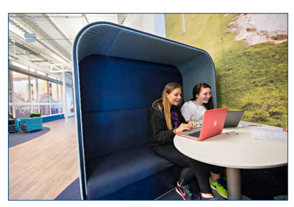
Photo 1: These booths give a private feel for small group work in a large open reception area at the University of Brighton.

Well designed learning environments offer facilities that are appropriate for the needs of the institution's learners and spaces that can be adapted to meet a variety of different learning requirements. Furniture which is easily configurable, controllable lighting and portable technologies all have a part to play and low tech user-friendly tools have their place alongside digital technologies. Physical space should not constrain the types of learning activity that can be supported and we need to keep future needs in mind, but we cannot demand that all space should be flexible because of the difficulty in defining what we might want to achieve by this (see the Viewpoints below and Section 4, Effective learning by design).